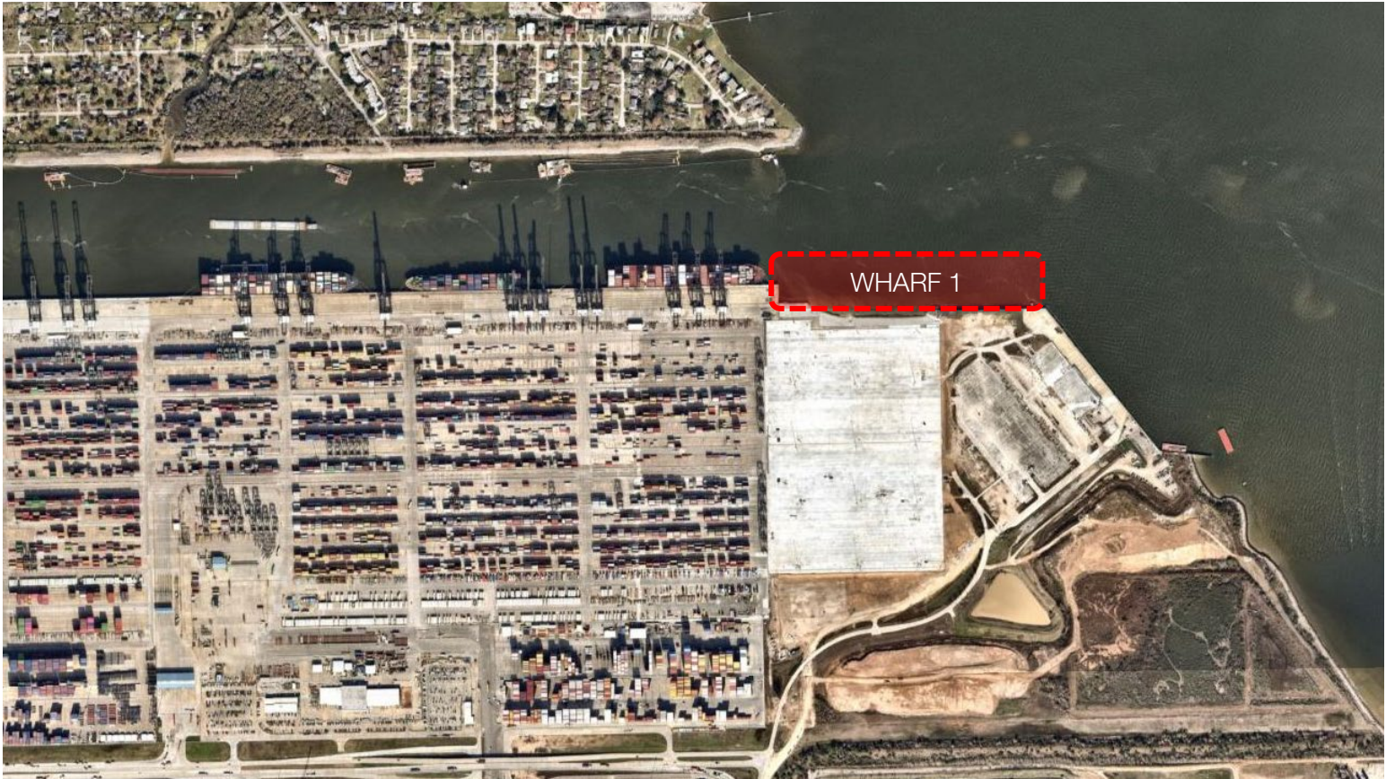
Construction of approximately 1,600 feet of new wharf structure at the Bayport Container Terminal. The project scope includes surveying, dredging, drilled shaft foundations, structural concrete, crane rails, fender systems, utilities, and a stevedore support building.